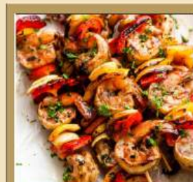
GRILLED SHRIMP SKEWERS

Grilled Vegetable Skewers – Fresh carrots, zucchini, broccoli, mushrooms, and cherry tomatoes, grilled onsite to perfection and finished with our house-made Provenzal sauce — a savory blend of garlic, olive oil, and parsley.