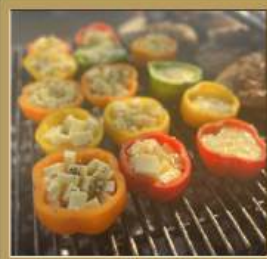
GRILLED BELL PEPPERS

Charcoal-grilled whole potatoes, prepared on-site and served with your choice of chimichurri or a creamy homemade blend of blue cheese and cream cheese, topped with scallions.