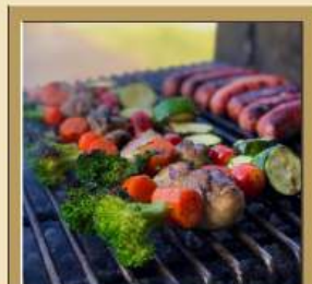
GRILLED VEGETABLE SKEWERS

Meaty portobello mushrooms, expertly grilled onsite and finished with a light seasoning to bring out their rich, earthy taste.